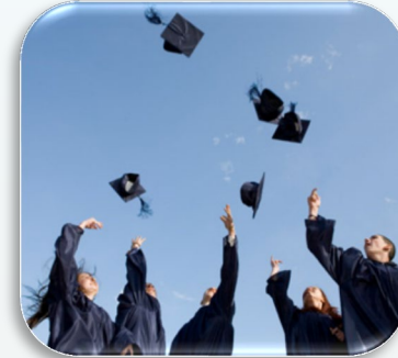
Pre-Employment Transition Services