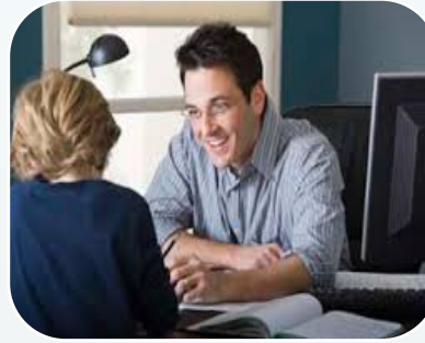
Guidance and counseling services