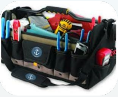
Tools & Equipment