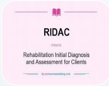
Diagnosis and evaluation of capacities/limitations