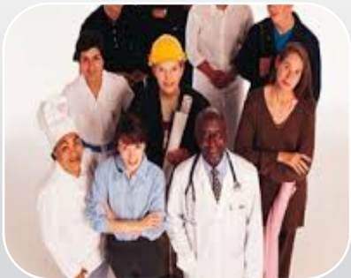
Career and technical education