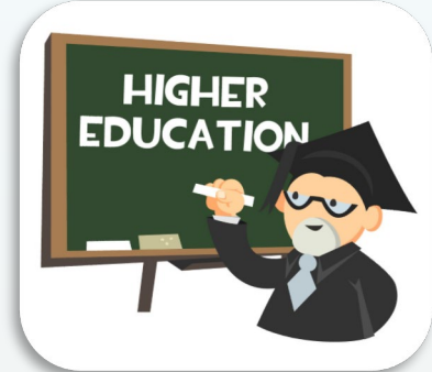
Post-Secondary Education Assistance