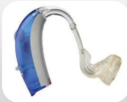
Physical and cognitive restorative services